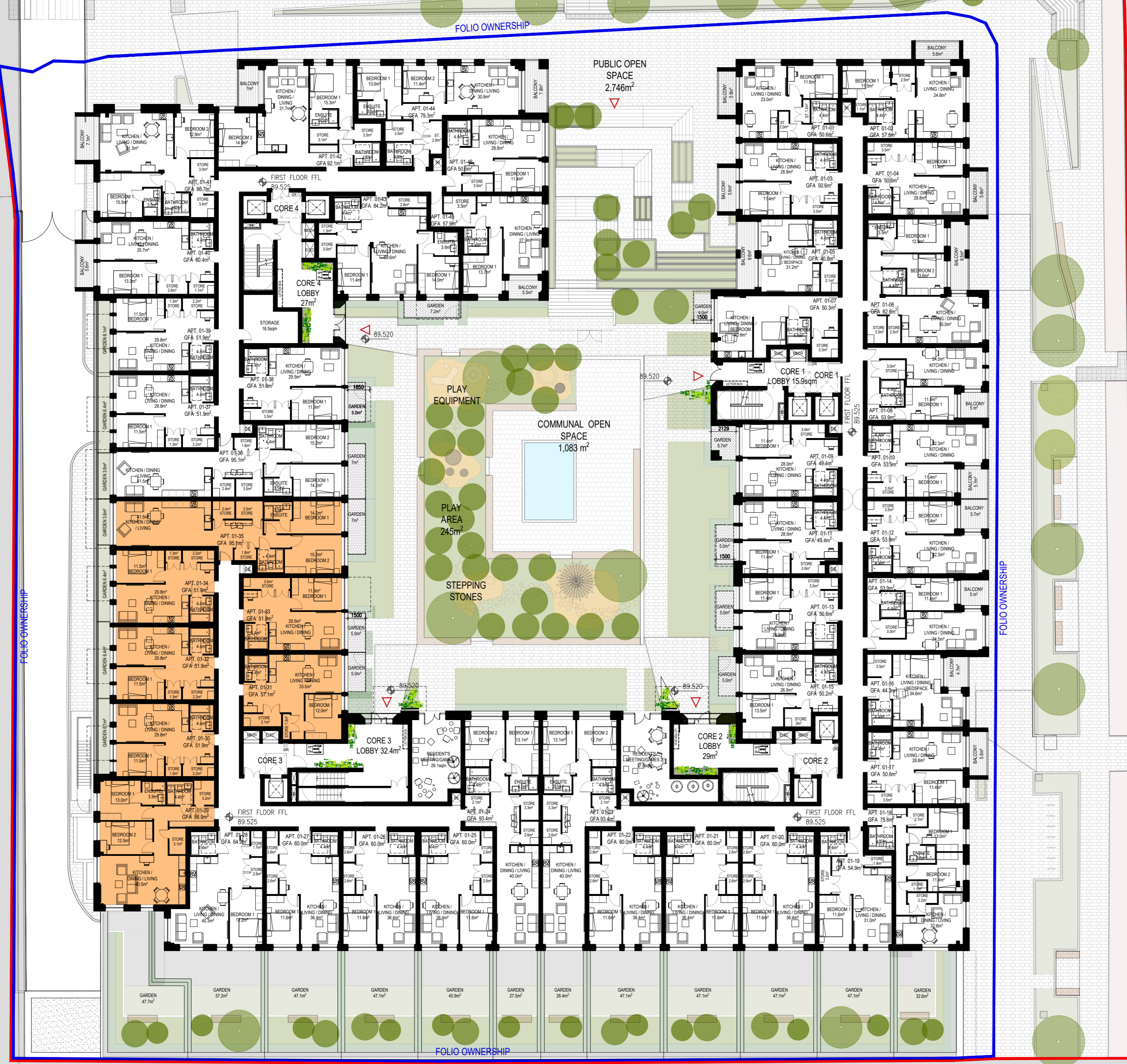
010 01 Part V Units Locations - First Floor 1:250